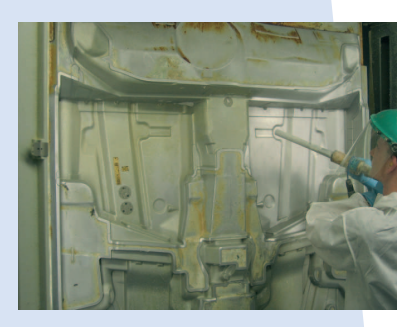
Reconditioning motor parts