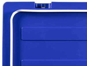
Hygienic silicone seal