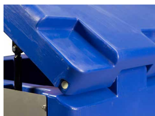
Integrated full length hinge