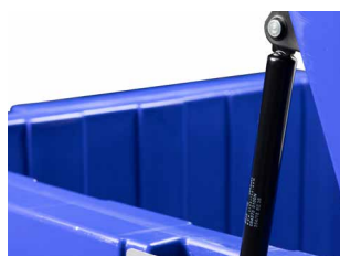
Lid opening assisted by gas springs