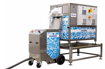
Dry ice blasting machines can directly be filled with dry ice