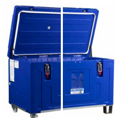
Exchangeable steel feet or 4 pivoting wheels (2 bracked)