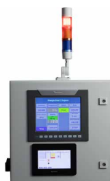
Pelletiser, scale and CO 2 detector can be controlled by a remote controller