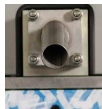
Quick die change with 4 bolts