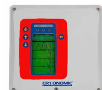
CO 2 detector