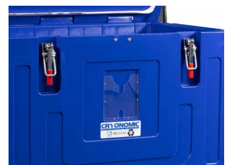
Including document holder